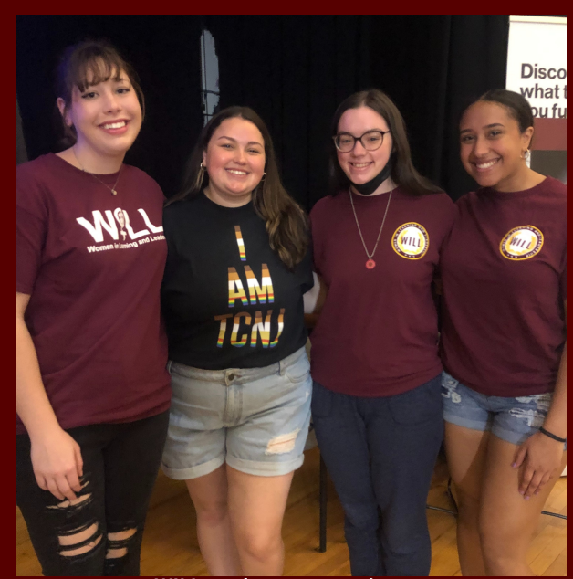
WILL students presenting at Middle School Day in Trenton area schools

https://will.tcnj.edu/ 609-771-2178 colbeth@tcnj.edu