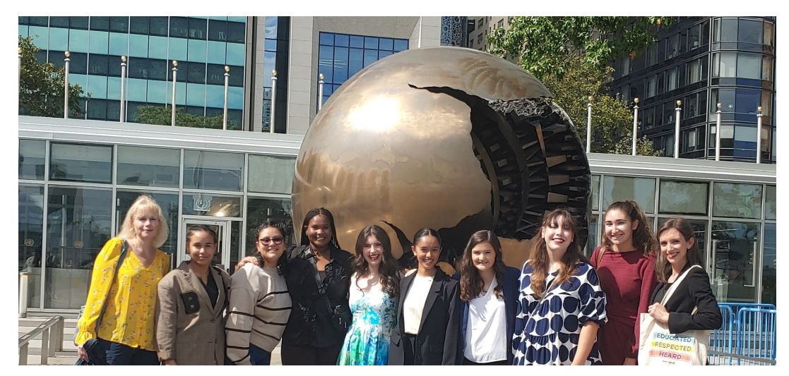
TCNJ WILL Students at the United Nation's 2024 SDG Action Weekend Workshop on the Elimination of Violence Against Women and Girls.