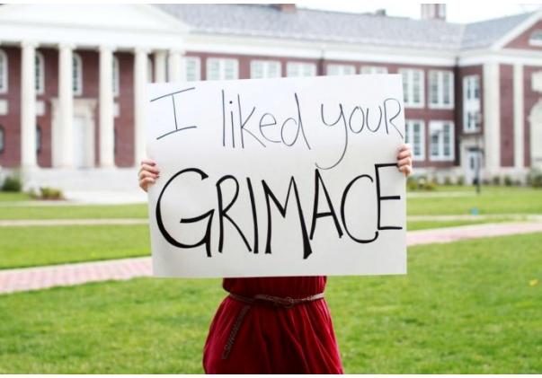
TCNJ Unbreakable's video can be found at: <a href="http://www.youtube.com/watch?v=750Jj2MQGk8&feature=youtu.be">http://www.youtube.com/watch?v=750Jj2MQGk8&feature=youtu.be</a>